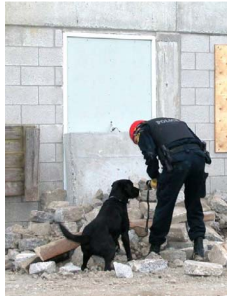
Police Canine unit searching for victims in and around building

Emergency Medical Assistance Team) in conjunction with local healthcare authorities will be conducting a mock disaster exercise in the City of Windsor, Ontario. Once again, Anvil has been asked to deploy its RECoN solution (voice over IP, live video, data solution over the BreadCrumb® wireless infrastructure).