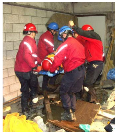
Heavy Urban Search and Rescue (HUSAR) team evacuating victims from disaster site

Rajant Corporation www.rajant.com 400 E. King Street Malvern, PA 19355 Phone 484-595-0233 Fax 484-595-0244