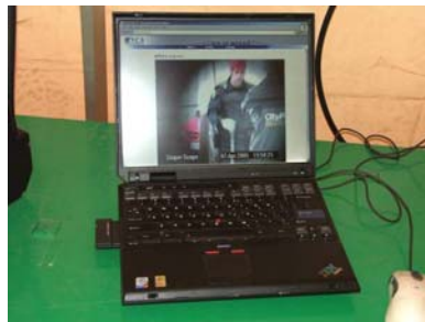
Real-time video feed of rescue effort, sent over BreadCrumb® network.