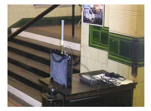
BreadCrumb® XL linked to satellite truck one block away.

The network was also extended to the bottom level by two Rajant ME units which operated down a lift shaft forming redundant links to the bottom. At the bottom, additional SE units were deployed to the platform creating a seamless broadband network from satellite link to platform. Anvil's flashlight camera streamed video of a simulated suspect package on the platform to observers in the lobby