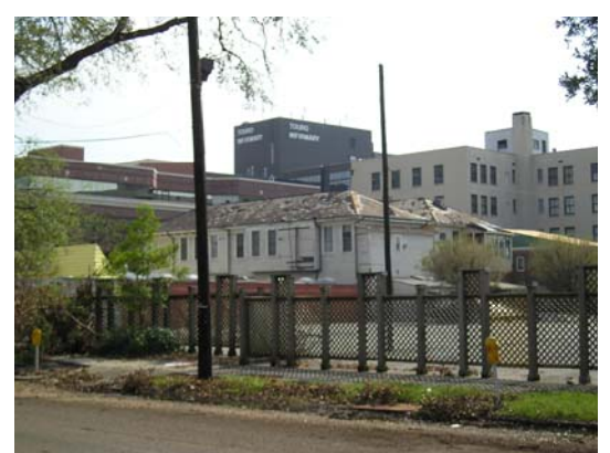
Touro Hospital, in New Orleans, Louisiana

The tactical network enabled the needed connectivity and allowed the IT department time to focus on troubleshooting their hospital network. The network bypassed the IT room and linked the satellite service directly to areas of wired infrastructure in several of the critical areas and created wireless access in all other target areas. This allowed senior staff to focus on restarting hospital operations and the preparation for the treatment of patients with the communications tools they needed. The BreadCrumb® network created connectivity to the emergency room, hospital administration stations, IT hub, and maintenance sections. Temporary Centers for Disease Control operations were established in a medical center building located one block away. Due to the superior range and meshing capabilities of the BreadCrumb® units, the CDC personnel were able to utilize the wireless network from their location as well.