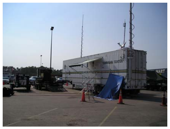
Polk County Command Center in Bay St. Louis, Mississippi